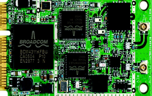
802.11a/g PCI Express Reference Design