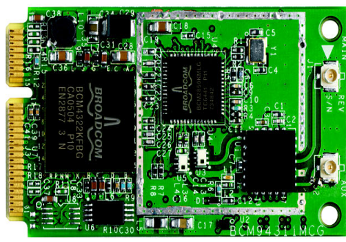
802.11b/g PCI Express Reference Design